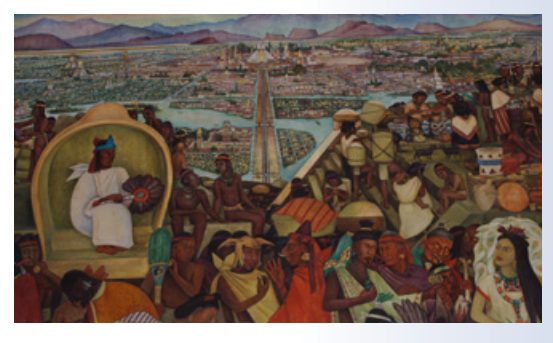
Diego Rivera's portrayal of the candled city of Tenochtitlan

Another piece of this history of Mexico City that is extremely relevant to the contemporary concern over immigration is the US invasion of Mexico City