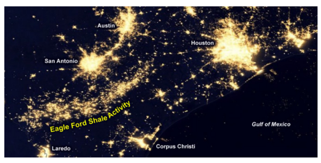
Eagle Ford Shale from NASA Suomi Satellite.

Newsletter of the Department of Sociology and Anthropology